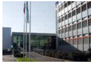
Product Center Flowtec Switzerland Flow Measurement Headquarters R&D, Production and Calibration