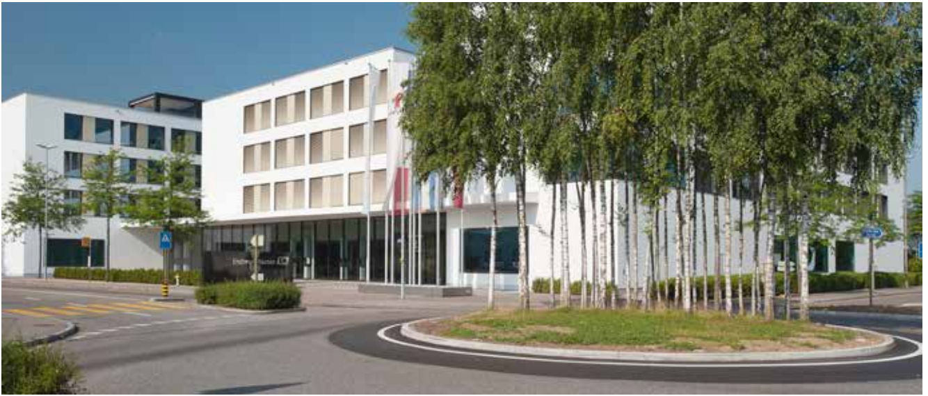
Endress+Hauser Headquarters in Reinach, Switzerland