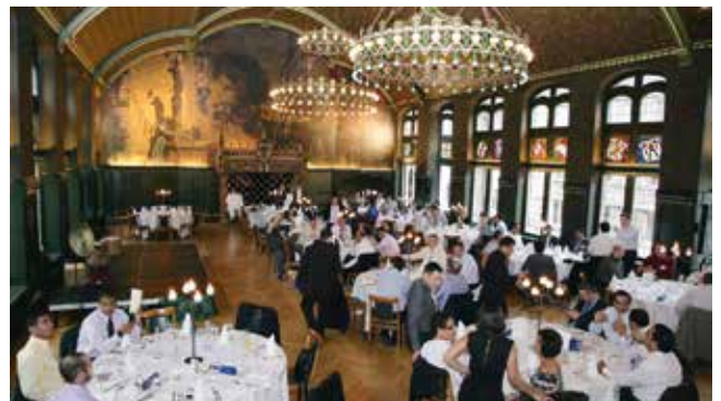
Dinner at Restaurant "Safran Zunft" with Endress+Hauser customers

Best places for shopping are the shopping malls Stücki and the St. Jakob-Park in Basel. Many jewelry and watch stores can be found at the shopping street Freie Strasse in Basel.