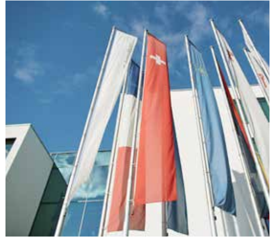
Endress+Hauser's head offices in Reinach, Switzerland.

Endress+Hauser has been a reliable partner for the process industry for more than 60 years. We provide comprehensive support to our customers, from the laboratory to the process.