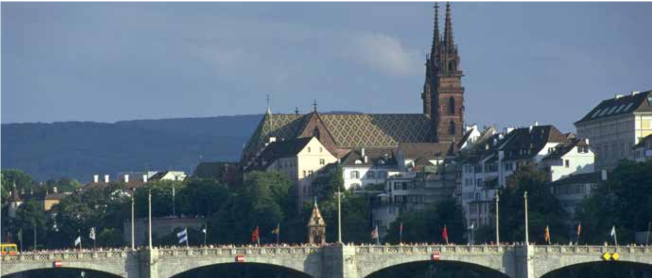
Cathedral of Basel, Switzerland with the river „Rhein“ in the front